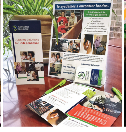
PATF's outreach materials are now available in Spanish and English.